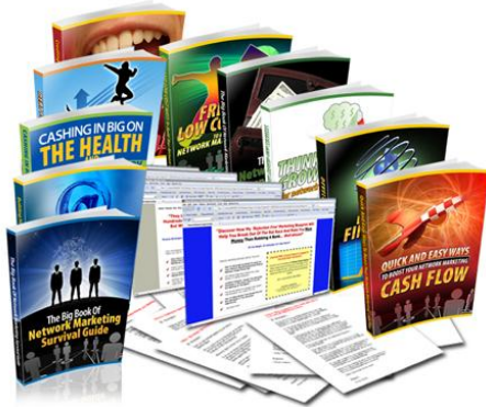
(Generated $25,392 in 7 days)