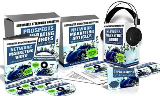
(Generating $12,392 Monthly!)

These are the income I've made from my business opportunities and my own products. They have made me up to $65,376 a month thanks to the marketing strategies I've employed.